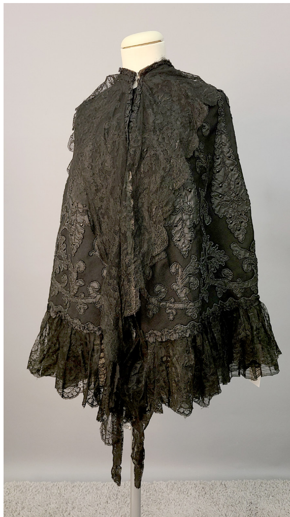
Black silk cape and detail of lacework, ca. 1880–90.