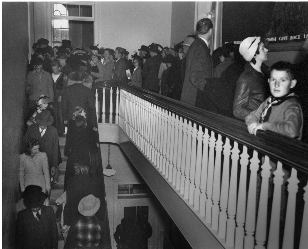
Eager to view the new museum on opening day, these visitors packed the stairwell and landing on Nevada Day, October 31, 1941.