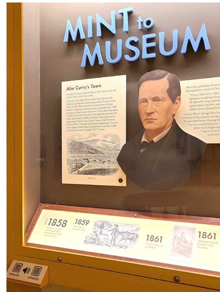
right: The final installation showing the title, timeline, and graphic storytelling.