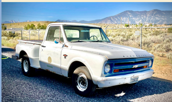
Nevada State Museum's 1967 Chevrolet Stepside Pickup before restoration.

Stay tuned for a more in-depth look into the pickup's history and the progress toward its full restoration coming up in the Fall 2024 Mint Edition Newsletter.