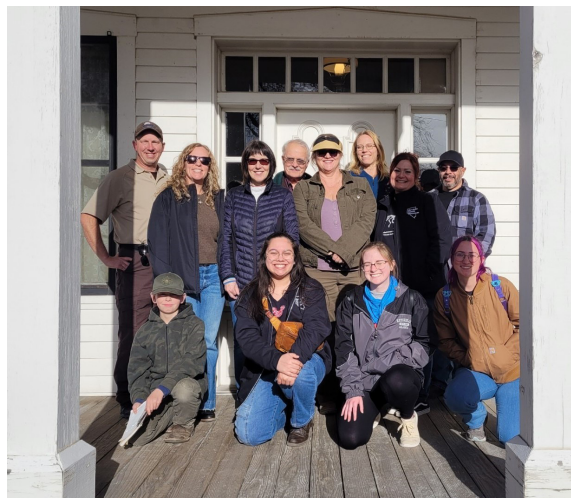
Nevada State Museum staff and volunteers pose for a photo with a State Parks ranger in front of Buckland Station.